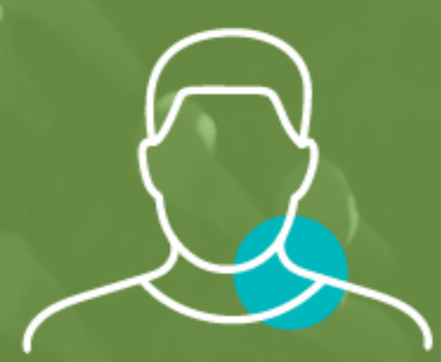
SWOLLEN LYMPH NODES